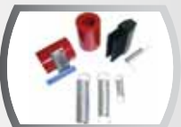
Spare parts kits