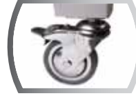
Optional swivel & locking casters