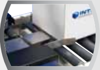
Box hold down device