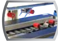
Offset tape heads process 2" high cases