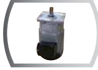
1/3 HP motors for heavy duty usage