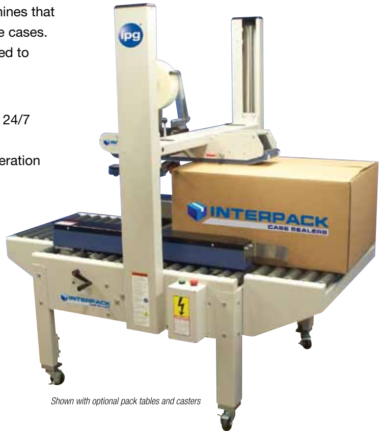
Shown with optional pack tables and casters

When you compare features, benefits and value, Interpack Case Sealers are the right choice for operators, plant engineers, maintenance and purchasing.