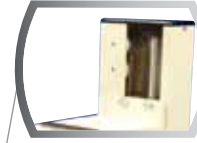
Slide & lock upper head for quick & simple size setup