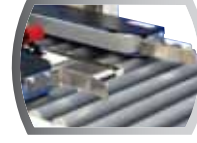
Case retainer infeed guides