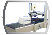
Infeed or exit tables available in 16, 24, or 36 inch lengths