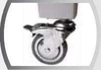
Heavy duty casters