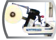
Tip-up tape head simplifies roll replacement