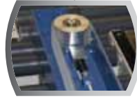
Self-tensioning & tracking side drives simplify belt replacement