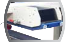
"Floating" upper head for mild overfills